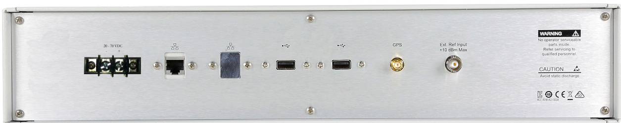
MS27103A Remote Spectrum Monitor (front and rear sides shown, Option 110 replaces screw terminal with 3-pin AC line receptacle)